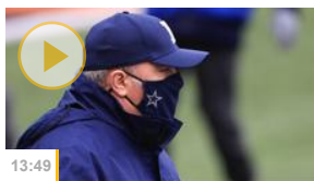
13:49 McCarthy's focus in 2021 will be fixing defense