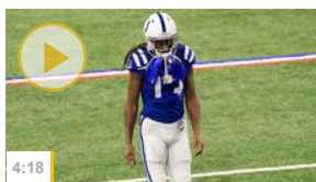
4:18 Colts' Hilton still has something left in tank

One of the top cornerbacks in this year's draft will not be taking part in a Pro Day workout because of a back issue that needs to be repaired surgically.