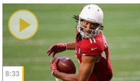
8:33 Are the Bucs the best fit for Fitzgerald?