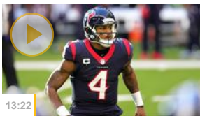
13:22 Could Texans' Watson face criminal charges?