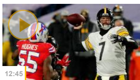
12:45 Can the Steelers count on Big Ben in 2021?